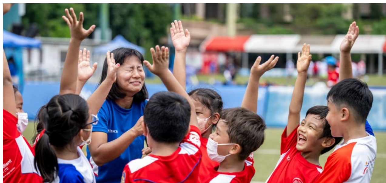
IBEL Fun Day, IBEL 同樂日