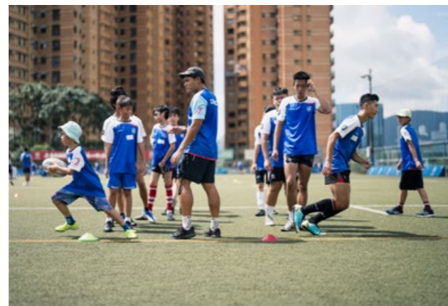
Jockey Club Rugby United Programme, 賽馬會「友情達陣」欖球計劃