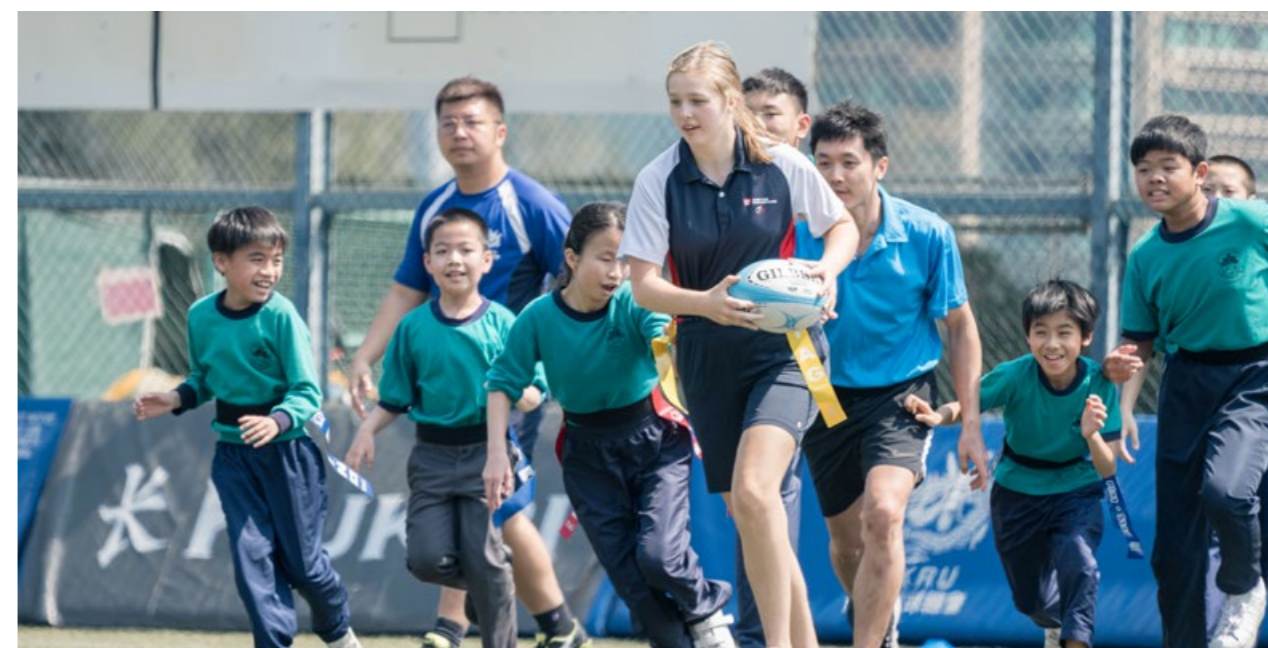
Po Leung Kuk Buddy Rugby with Ageas, 「保良百·錦欖出友情」計劃