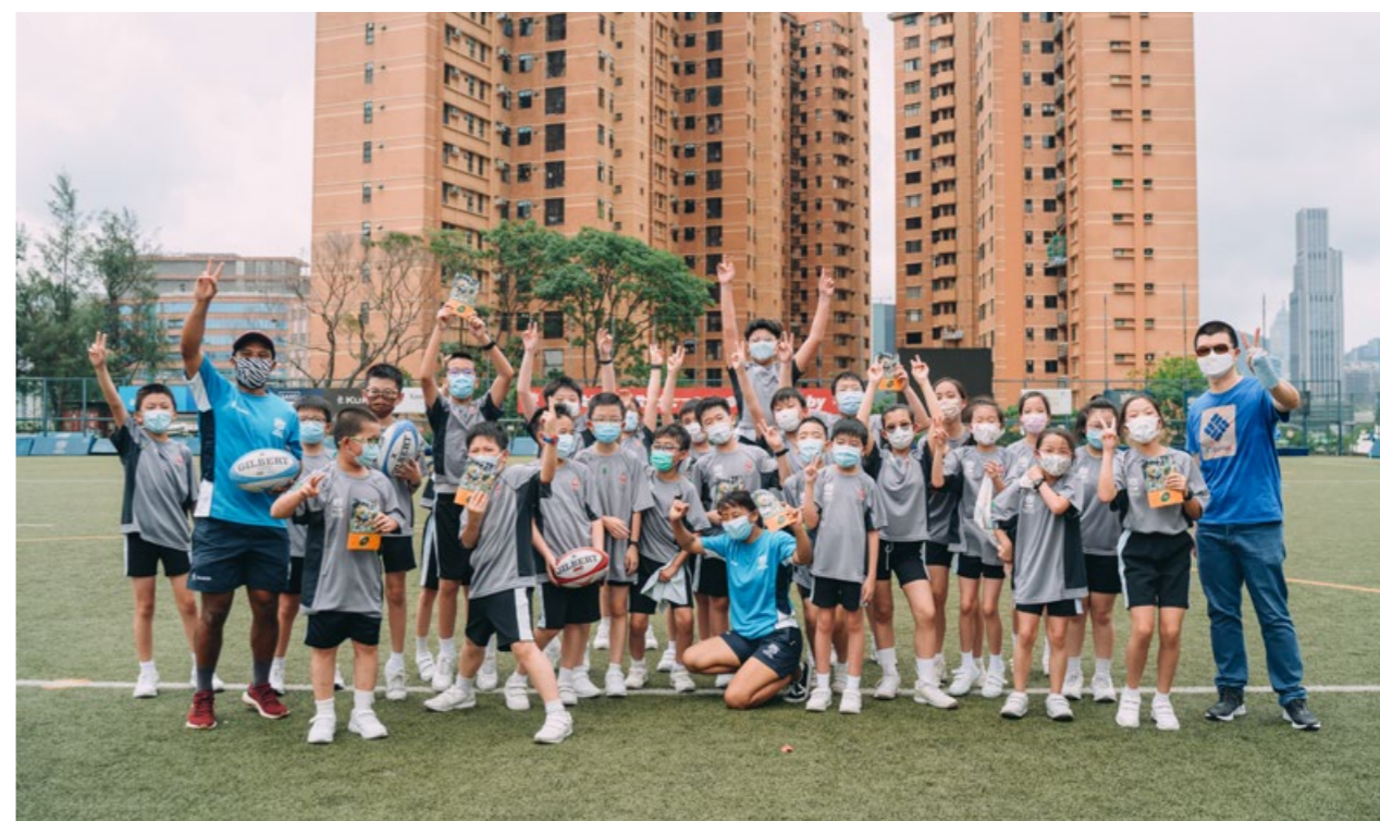
Rugby English Active Learning (REAL) Programme with SCOLAR, 語常會「英語欖球學習計劃」