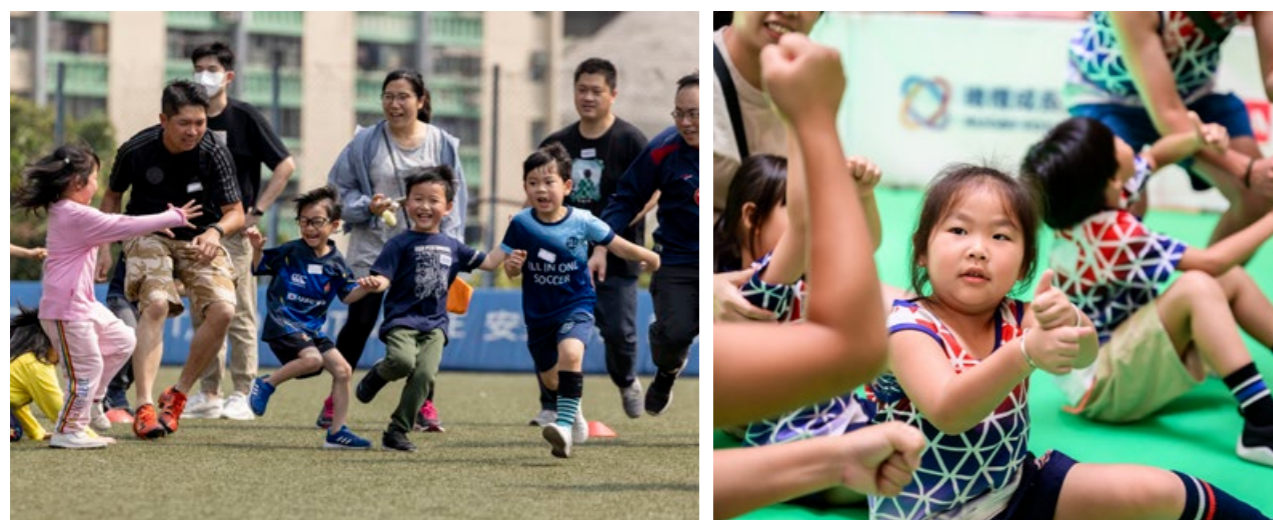
Deaf Rugby Programme with Wilson Group, 威信集團聾人欖球計劃