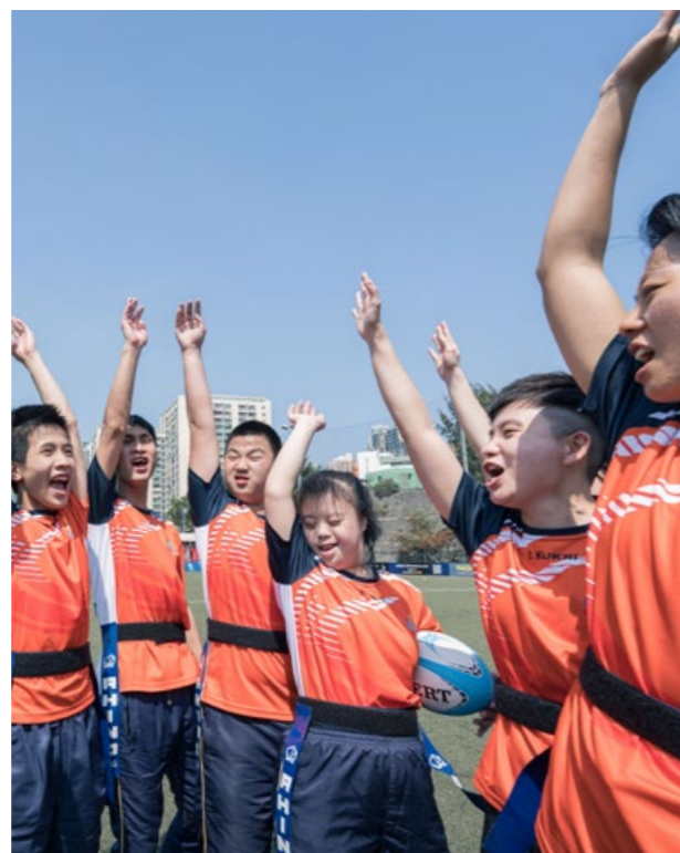
Ageas Inclusive Rugby Programme, 富通共融欖球計劃