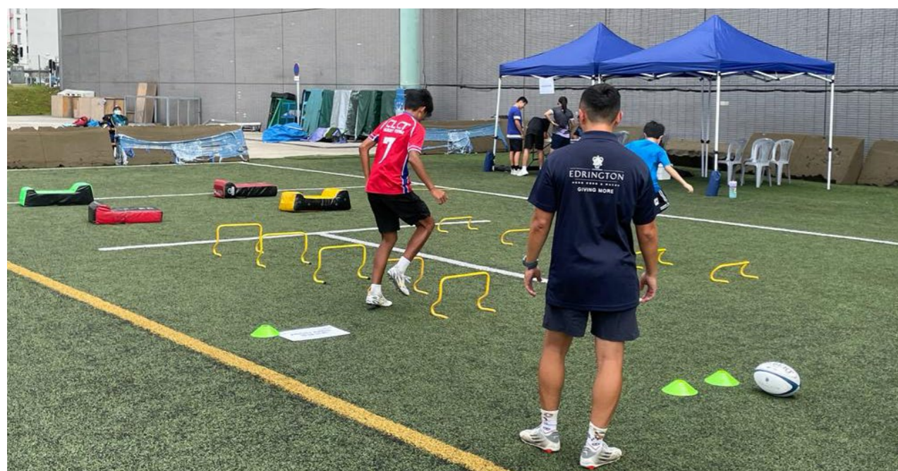
Edrington Community Rugby Engagement Programme, 愛丁頓社區欖球參與計劃

10-16 Year Old's Local School Children Benefited 位 10-16 歲本地學校學童受惠