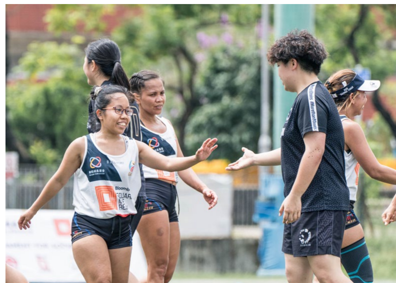
Square Mile Sport: Domestic Helpers Rugby Programme, Square Mile Sport: 外籍家庭傭工欖球計劃