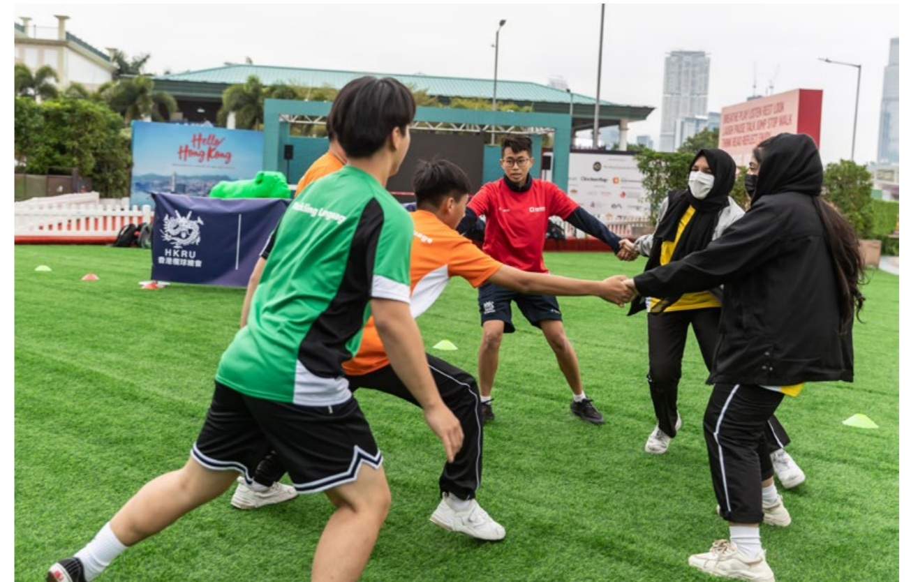
Tackling Language, 嘉道理基金會「Tackling Language」計劃