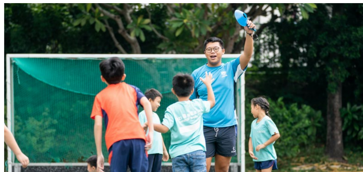
Rugby for Children with ADHD and their Families, 關顧 ADHD 兒童親子欖球計劃