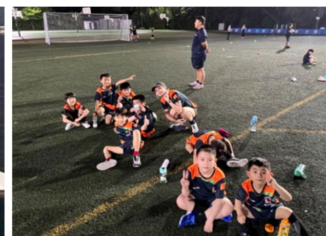
Embrace Wellness — Youth Training Programme, 擁抱健康——青少年欖球訓練計劃